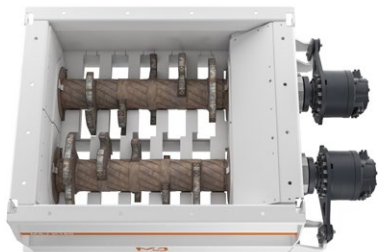
Cutting table 5 knives